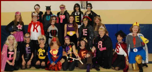
Mini Kuper Staff Hallowe'en Photo

Happiness often sneaks in through a door you didn't know you left open.